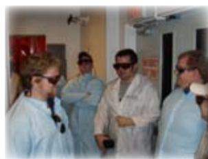
Our visit of the LBNL laser lab

We took a trip to Lawrence Berkeley National Laboratories (LBNL) this year and toured their laser lab and the Advanced Light Source. The ALS is a synchrotron radiation facility that produces very bright and energetic radiation for use in a wide range of sciences and experiments. In the laser lab, we got to see the facility's plasma accelerator which they boast can produce GeV levels of energy in just 3.3 centimeters. Next year we would like to visit the much larger Stanford Linear Accelerator.