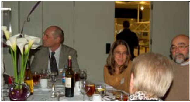
Enjoying dinner in the commons