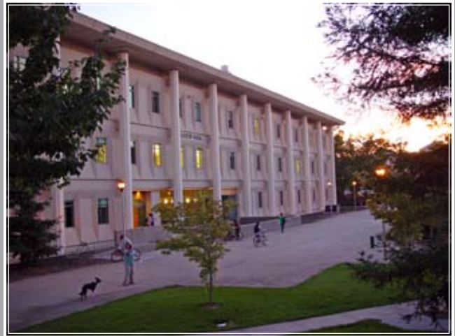
The "new" Darwin Hall