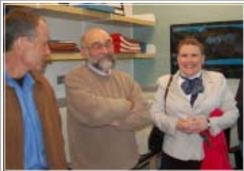
the new alumni enjoyed a commons