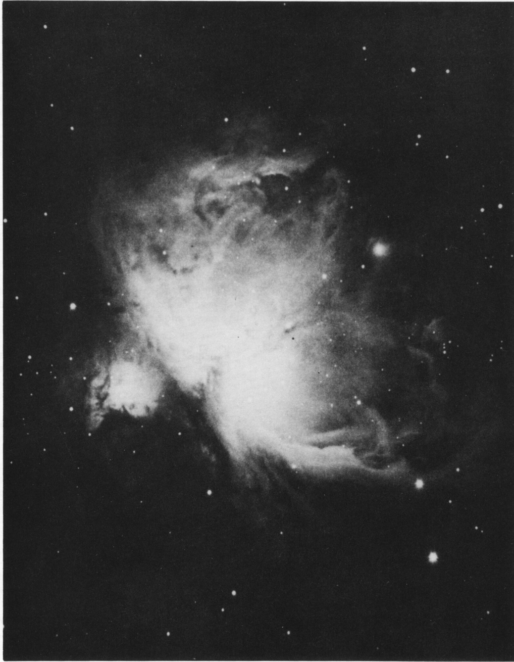
James Edward Keeler obtained a stunning photograph of the Orion nebula on 16 November 1898, with the 36-inch Crossley Reflector at Lick Observatory. Pictures like this inspired more than one generation of astronomers. Their visual impact was exceeded only by the novelty of color, when it came from Palomar and appeared in National Geographic Magazine in 1959.