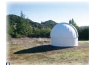
NASA Telescope at Pepperwood Preserve